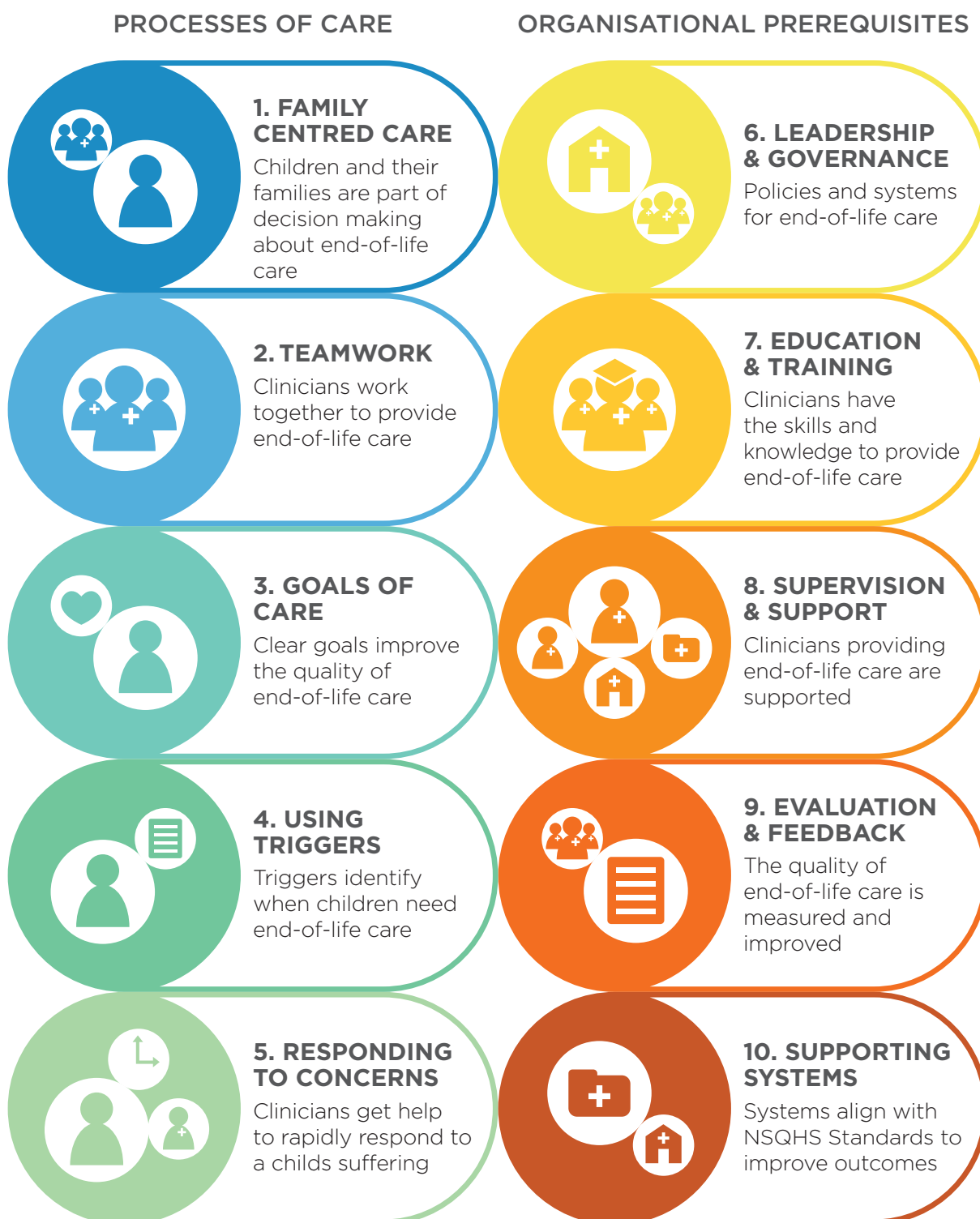
Figure 1: Overview of the 10 essential elements in the Consensus Statement